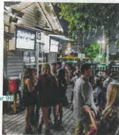
Bar + B

Rainey Street was part of a normal neighborhood until 2004, when the city rezoned it to allow commerce. But instead of bulldozed homes replaced by flashy towers, the 100-year-old bungalows were converted into bars and lounges. That's made the street popular among locals and tourists alike.